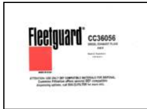
Date Code Label

A. While DEF exposure to constant, high storage temperature may have some impact on shelf life, this should not concern operators. Extensive testing in very hot climates has been conducted confirming that DEF stored at a constant temperature of 95 deg F had a shelf life of over 6 months.