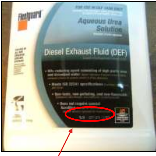
Date Code Imprint

The first digit of the date code represents the DEF batch number and the next 6 digits reflect the date that the batch was filled.