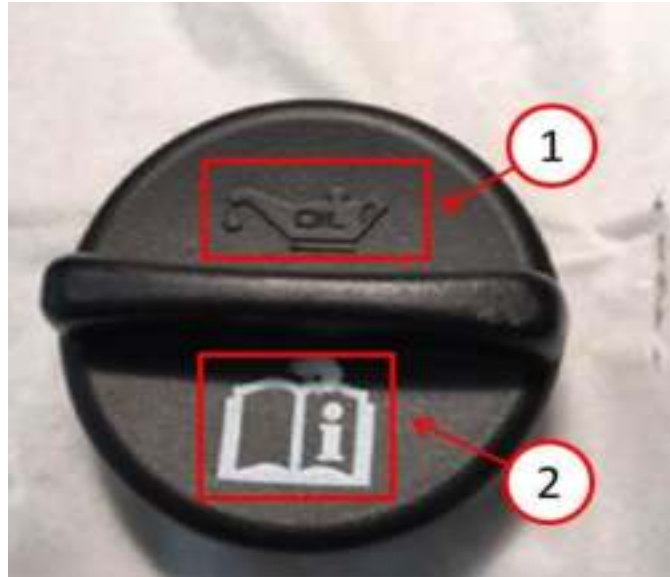
Fig. 1 Cap Before Sticker Applied

NOTE: Contact your National Sales Center or General Distributors for oil fill cap stickers and a copy of the Owner's Manual Addendum cards.