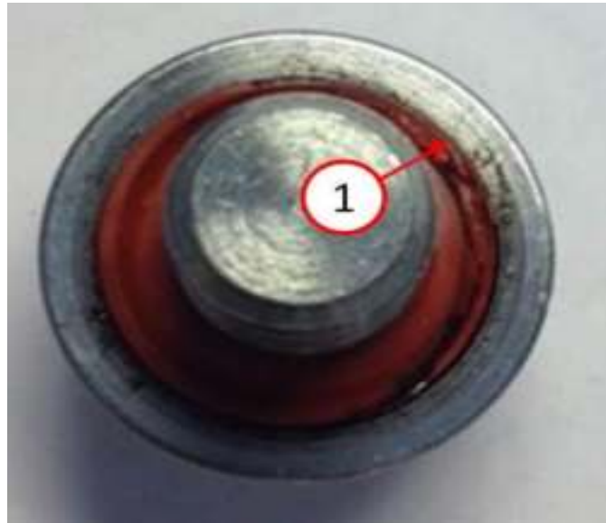
Fig. 2 Damaged Rubber Seal