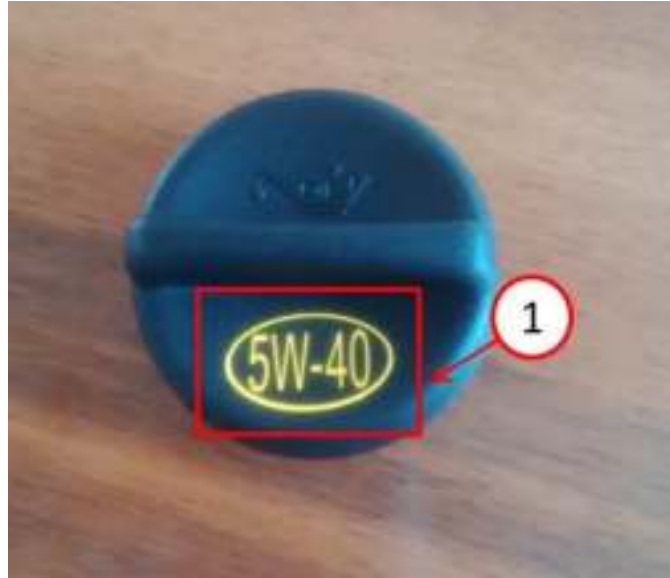
Fig. 3 Cap After Sticker Applied

1 - "5W-40" Sticker Affixed To Oil Filler Cap