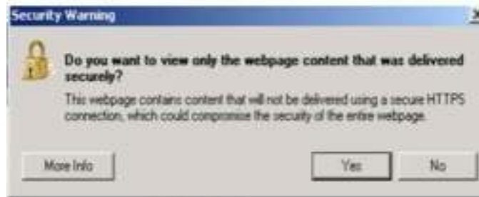
Fig. 1 Pop-up Security Message

NOTE: A Blank USB flash drive must be used to download the software. Only one software update can be used on one USB flash drive. One USB flash drive can be used to service multiple vehicles.