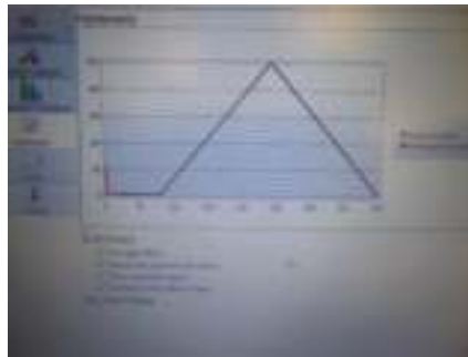
Actuator test passed.