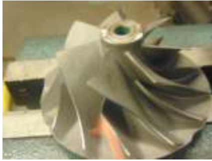
No damage to compressor wheel.