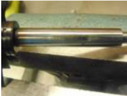
No damage to turbine shaft.