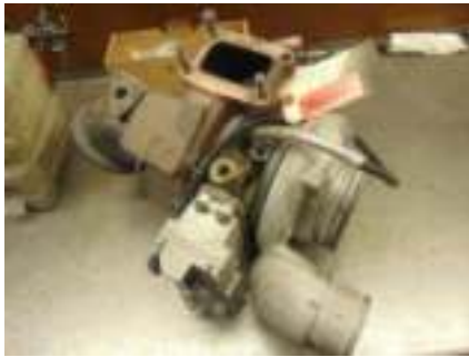
Turbo as received.

Findings: Denied - Inspected turbo for customer complaint of "way down on power, no boost" and found no signs of external damage or tampering. Actuator calibration was verified and found to pass all OEM operational tests. Turbo was then disassembled, inspected, and bearing clearance measured. No damage was found to any components and bearing clearance was in specification. No failure found.