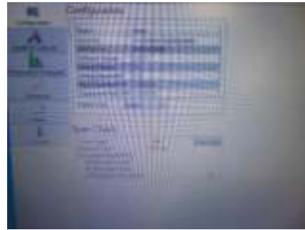
Actuator test passed.