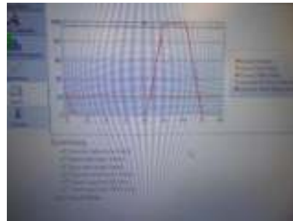
Actuator test passed.